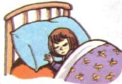
She is sleeping.