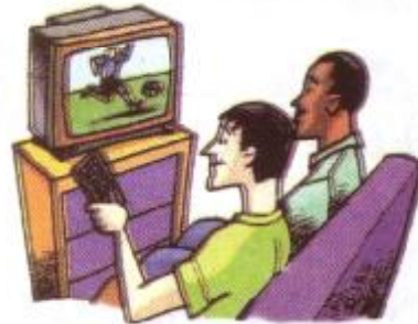
They are watching TV.