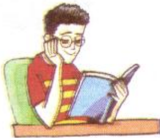
I am reading a book.